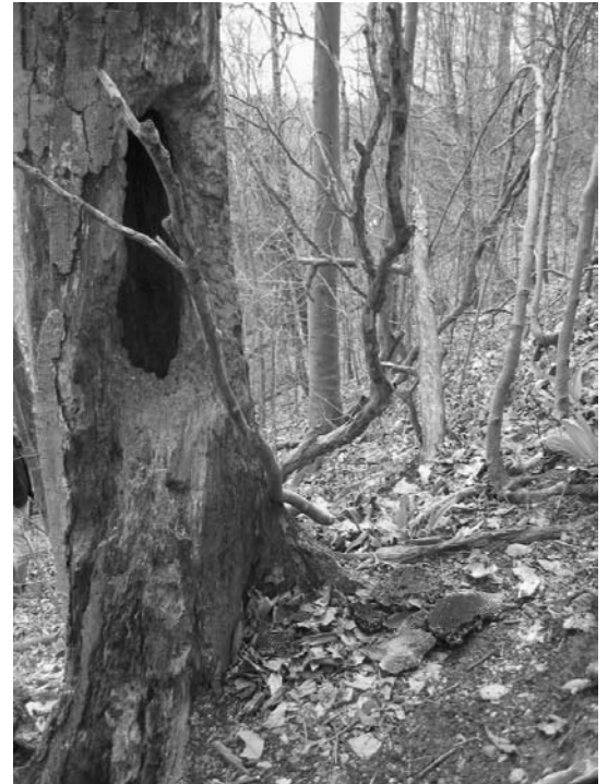
Who's been to dinner? Honey combs on the ground and a ragged hole in this snag tell of one black bear's sticky meal in Jean Wagner's VFF-certified forest.